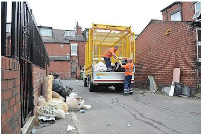
This is a back street in Beeston Hill.

Dewsbury Road is an area of special concern with a total of 31 late night takeaways operating from this busy area of Beeston. Not all the takeaways are licensed for the sale of hot food after 11pm and most are not controlled by conditions relating to litter nuisance. This has led to this area becoming of concern on the grounds of public nuisance caused by the amount of litter accumulations in the area.